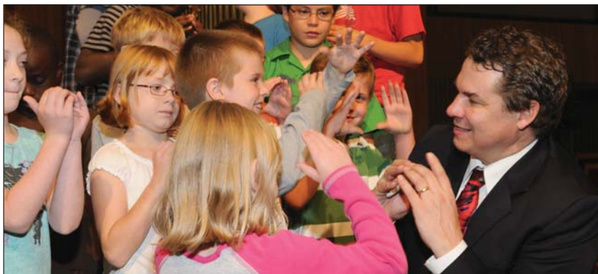
Greg Mortenson, author of Three Cups of Tea , chatted with students from George Stone Elementary School after a talk on Union's campus.

Mortenson's title, Three Cups of Tea , comes from a concept in Afghani and Pakistani culture. Although symbolic, in order to do business, two individuals must have tea three times. At the first, they are strangers. After the second tea, the two become friends. By the third gathering, they trust each other like family. This process of friendship building can take