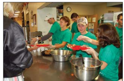
A group of students helped serve lunch to Lincoln's undernourished at Matt Talbot Kitchen.